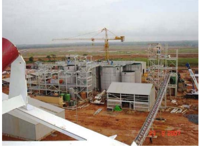
Figure 2 – View from on Top of Conveyor 6 of the Plant at Youga, September 2007 (after)

The 11 km water pipeline and power line to the pumping station on the Volta River (Figure 3) has been completed. While a temporary pumping capacity is in place, the permanent pumping station has not been completed due to high water levels. Interestingly, having visited the project in December, it is now difficult to imagine the river overflowing its banks.