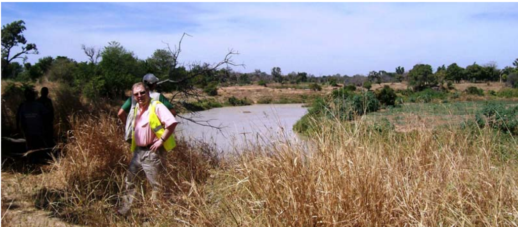
Figure 3 – Site of Youga Pump Station, Volta River, December 2006