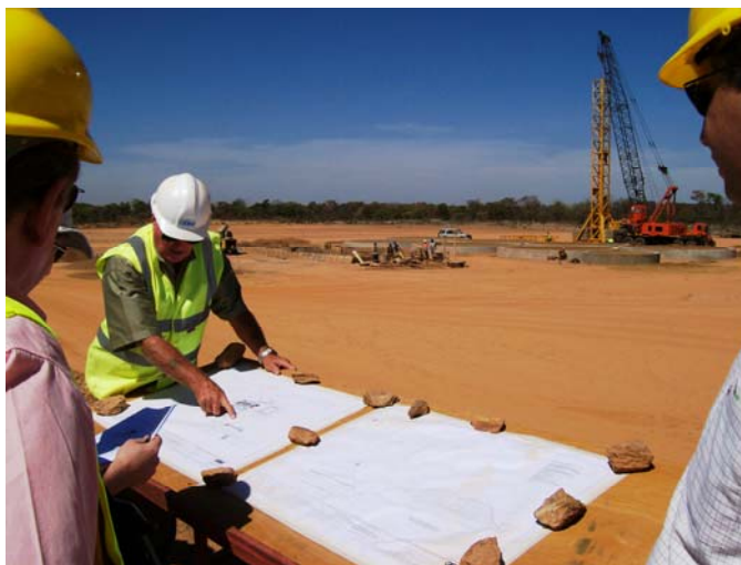
Figure 1 – Foundations Poured at Youga, December 2006 (before)

When we visited the Youga project last year we were impressed with the level of planning and preparation to complete such a challenging project (Figure 1). The project is located in a land-locked country with very little infrastructure, significant distance to commercial centers, and wet summer months. Based on relative construction experience of Etruscan's peers in West Africa, analysts on the visit to Youga were politely skeptical of the Company's chances for completing the project in 12 months. Etruscan previously completed construction of the Samira project in Niger, a harsher and less hospitable environment, so we were respectfully optimistic.