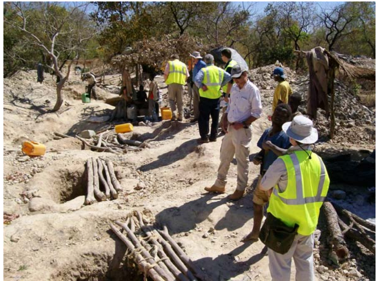
Figure 4 – Artisanal Miners near Youga Project, December 2006

Etruscan has completed a gold price protection program to “lock in” cash flow from production at Youga. The Youga project’s estimated average cash costs are $345 per ounce ($50 more until connected to the grid). For the period of the program, Etruscan locks in profits up to a gold price of $629 per ounce. Etruscan receives 100% of the price over this amount up to $700 per ounce, and 55% of the benefit over this level. While analysts may prefer complete exposure to higher metal prices, we see the benefit pale in comparison to the upside from a sustained exploration/development of Etruscan’s multiple other opportunities. Given Etruscans large and diversified land package and their history and relationships with West African nations, Etruscan has an unappreciated and well mitigated risk profile. We maintain a Strong Buy rating for shares of Etruscan.