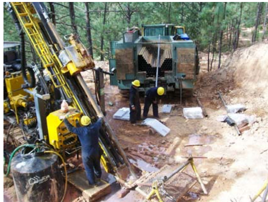
Figure 1—Diamond Core Drilling at San Miguel Zone, San Miguel Project

The latest drill results have extended ‘Clavo 99’ about 150 meters to the south (SM-21, SM-22, SM-23) and 50 meters to the north (SM-24), encountering mineralization at about 50 meters below earlier drilling. Drilling of ‘Clavo 99’ has defined a mineralized zone with a length of at least 400 hundred meters, presently dipping 200 meters. Mineralization is open to the north, south, and at depth, and is increasing in grade at depth. These are the characteristics which lead Paramount COO Larry Segerstrom to comment “that this high grade body may be much larger than previously thought... In appearance, grade, and mineralogy, this body of mineralization remains very similar to that of nearby Palmarejo.”