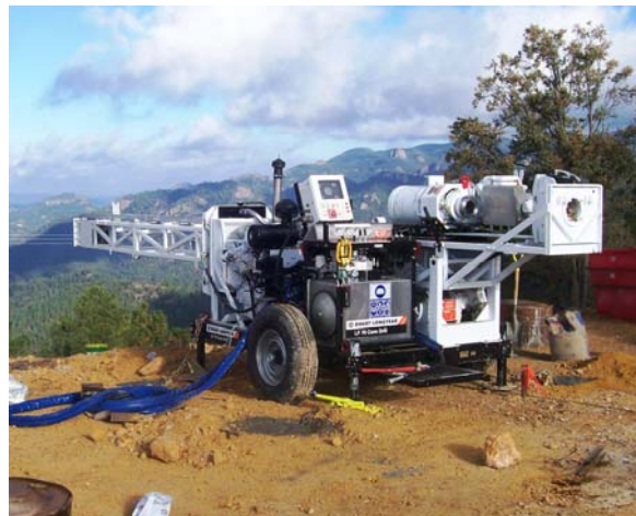
Drill Rig, Mexoro Project

We believe completion of the Alliance, while accelerating development of both companies’ respective projects, should accelerate their eventual merger. While Paramount gains an interest in Mexoro, Mexoro enjoys an infusion of cash important to advancing its projects. The alliance may have the benefit of increasing the ability of Paramount to secure additional financing. In addition to accelerating advancement of both companies’ projects, the most important benefit may be increasing their potential to secure additional financing. This is essential for increasing their appeal as an attractive acquisition by a major producer.